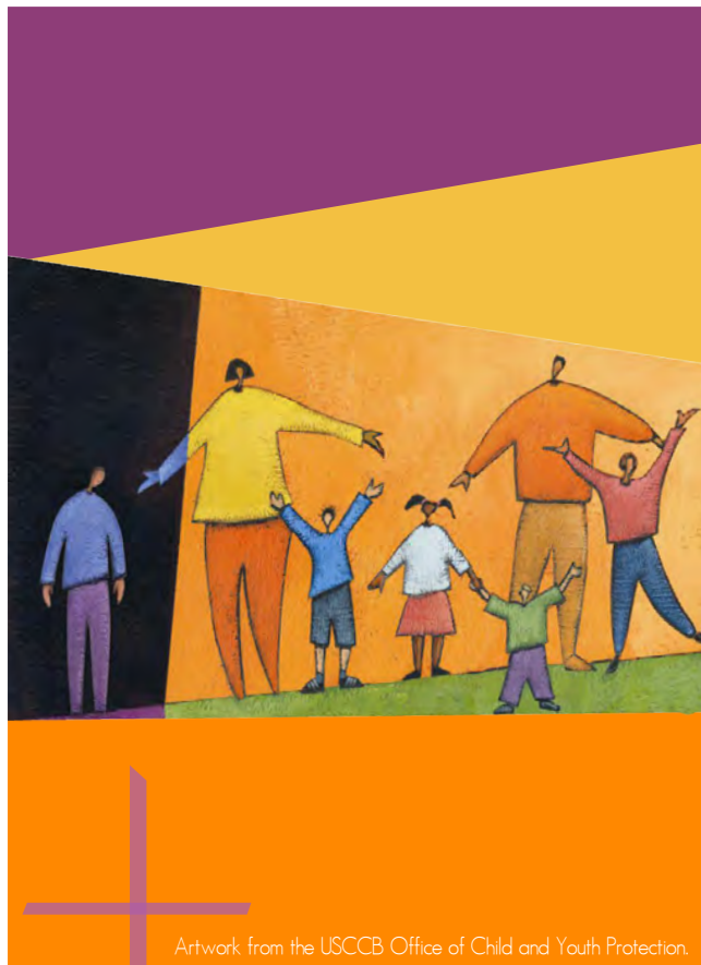
Artwork from the USCCB Office of Child and Youth Protection.