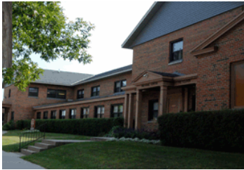
west of Cathedral High School