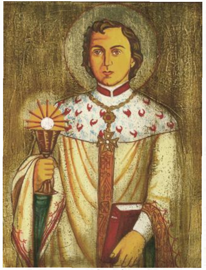
Icon of Saint Cloud