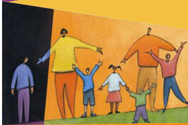
Artwork from the USCCB Office of Child and Youth Protection.