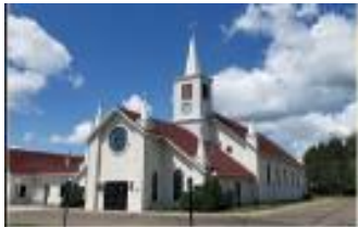
Holy Family Belle Prairie