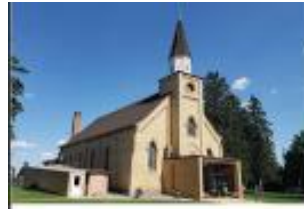
Sacred Heart Flensburg