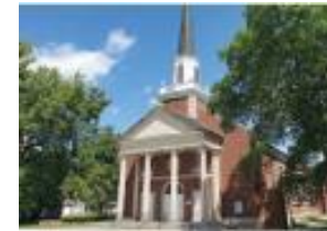
St. Mary's Little Falls