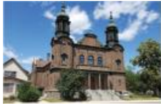
Our Lady of Lourdes Little Falls