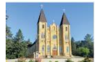
St. Stanislaus Sobieski