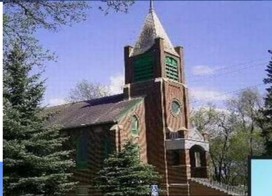
St. Mary's 347 Families