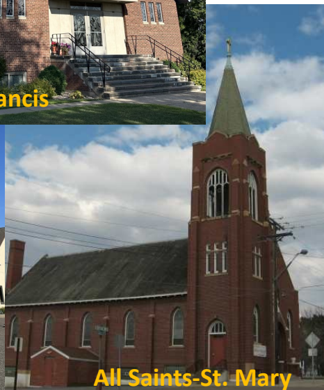
All Saints-St. Mary