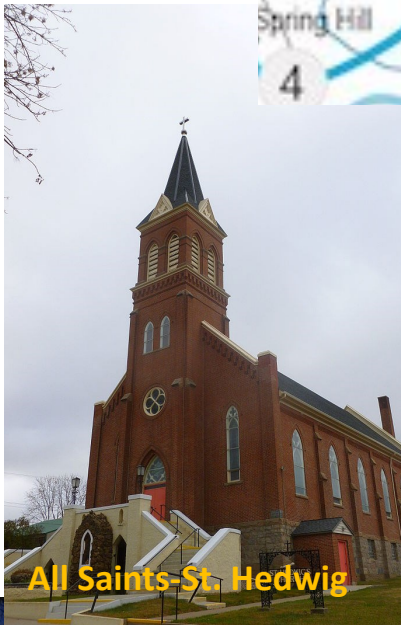
All Saints-St. Hedwig