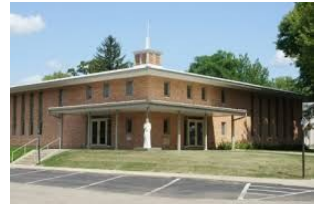
St Joseph, Grey Eagle