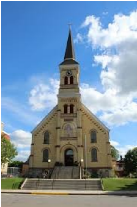
St Mary of Mount Carmel Long Prairie