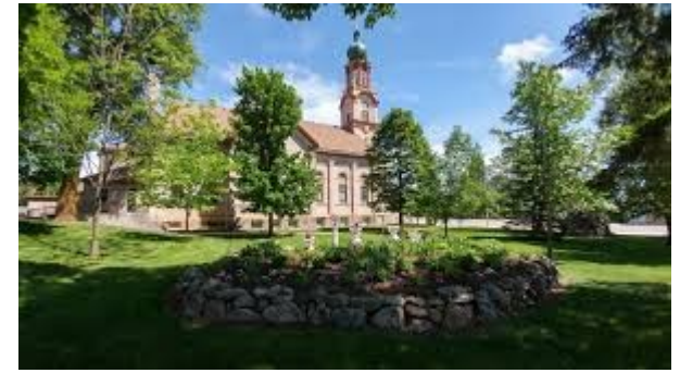
Christ the King, Browerville