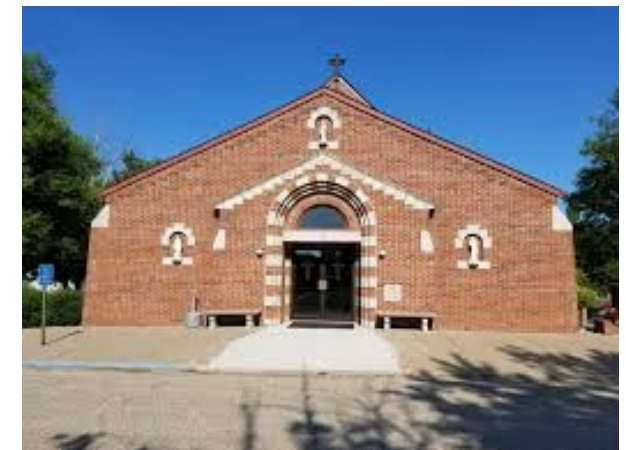
St Joseph, Clarissa