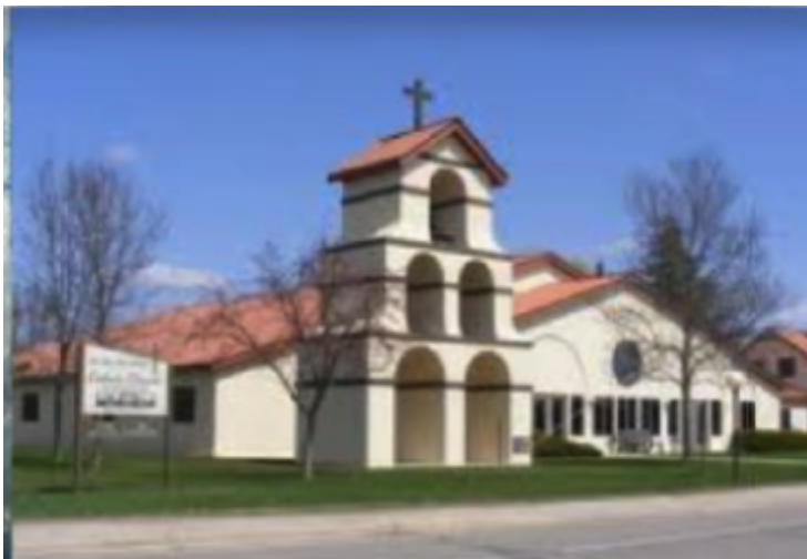
St John the Baptist, Swanville