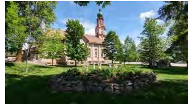
Christ the King, Browerville