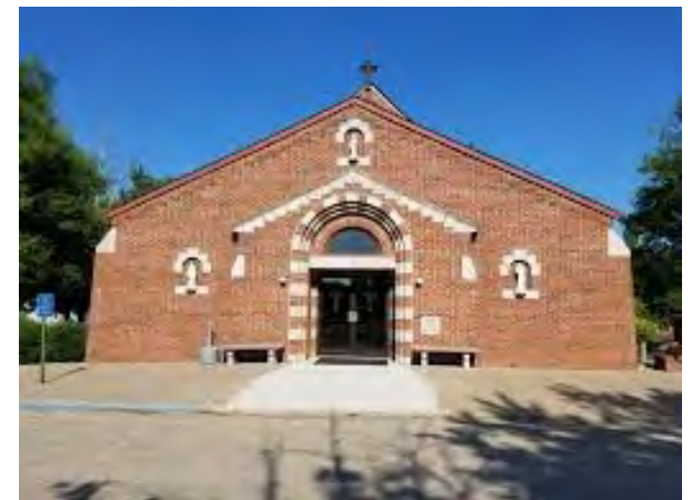
St Joseph, Clarissa