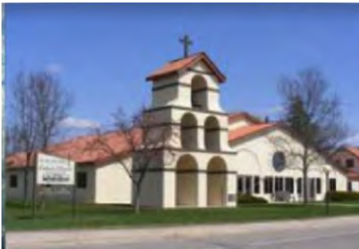
St John the Baptist, Swanville