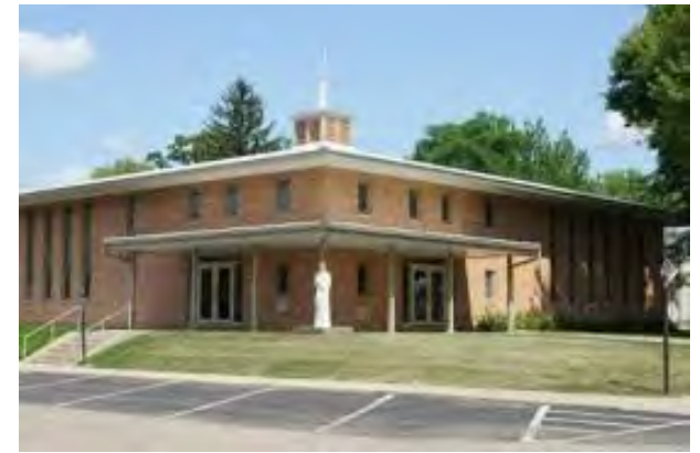
St Joseph, Grey Eagle