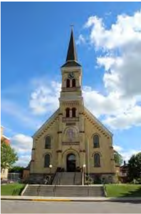
St Mary of Mount Carmel Long Prairie