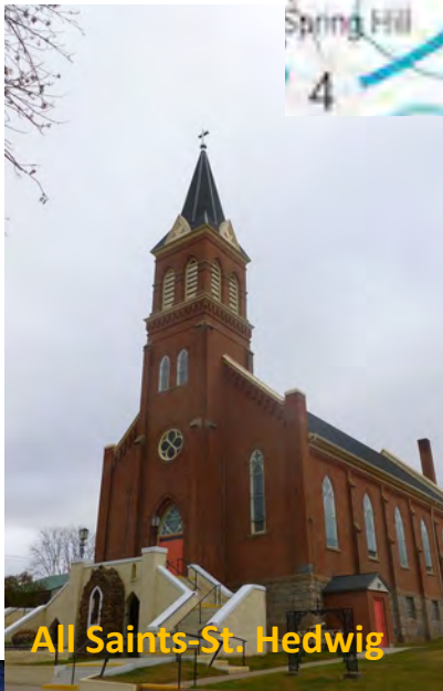
All Saints-St. Hedwig