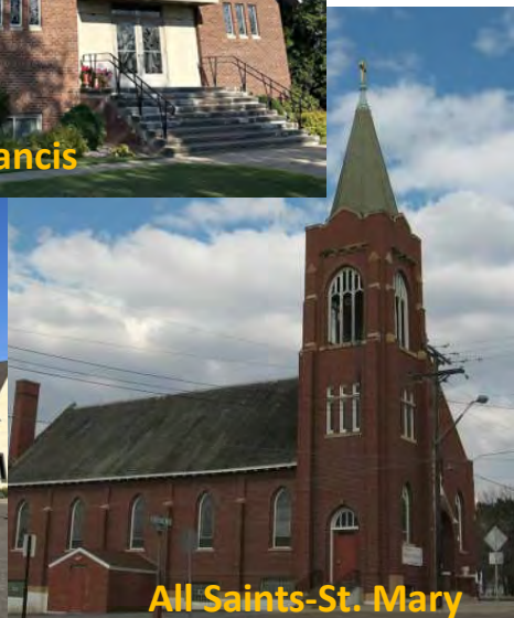
All Saints-St. Mary